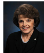
Senator Dianne Feinstein (D-CA)

Representative Panetta was born in Washington DC. He earned a B.A. in International Relations from UC Davis and a JD from Santa Clara University School of Law. He interned for the US Department of State, served a tour in Afghanistan in the Navy, worked in Alameda County's prosecutor's office, and served as Deputy District Attorney for Monterey County. His father, Leon Panetta, was a Congressman for 26 years. Rep. Panetta is a freshman politician, who was elected this year to replace Rep. Sam Farr's vacated seat.