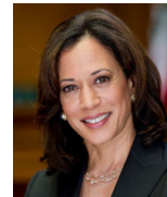
Senator Kamala Harris (D-CA)

Representative Anna Eshoo was born in New Britain, CT of Assyrian and Armenian heritage. She is a mother of two young adults and graduate of Canada College. She served on the San Mateo County Board of Supervisors for 10 years until she was elected to the U. S. House of Representatives in 1992.