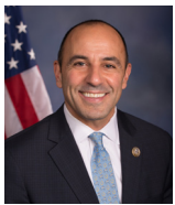
Representative Jimmy Panetta (D-CA 20th District)

The Members of Congress (MoC) Watchdogs issue group developed this newsletter to help you track your MoCs. Various sources, including VoteSpotter , Countable , GovTrack , VoteSmart , and FiveThirtyEight , were used in the creation of this newsletter. We reached out directly to the MoC offices when we needed further clarification or information that could not be found through our sources. If you'd like to contribute or provide some feedback, please e-mail our editors at indivisibleca20@gmail.com .